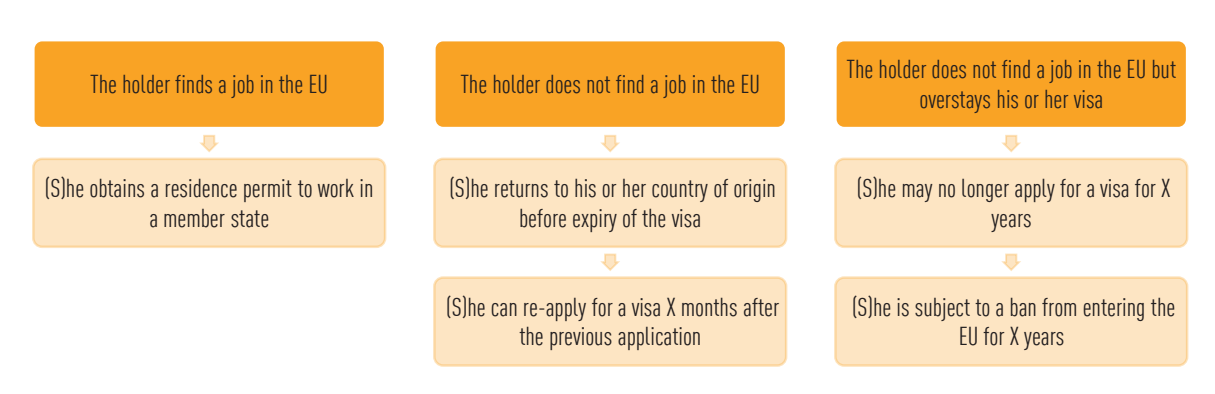
FIGURE 3 - Once the jobseeker's visa is issued:

If the person finds a job, (s)he is authorised to remain on the territory to practice it. Otherwise, (s)he must return to his or her country of origin before the visa expires. If, upon expiry of the visa, the person has not returned to the country of origin, a series of measures - return decision and entry ban - would be activated, thus preventing the person from applying for and receiving a new visa. Subject to the adaptation of the existing rules, national authorities would be authorised to enter return decisions and entry bans into the SIS and to identify the person who has failed to return to the country of origin within the allotted time for the purpose of refusing entry to EU Member States<sup>53</sup>. The entry ban decision for Member States could cover a period of up to five years. As a result, any future jobseeker's visa applications would be rejected as a rule for the entire period corresponding to notification in the SIS or to the entry ban.